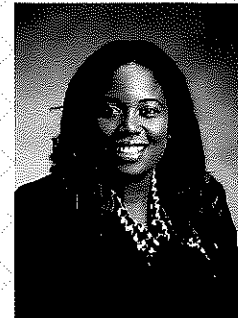
Assemblywoman Kimberly Jean-Pierre